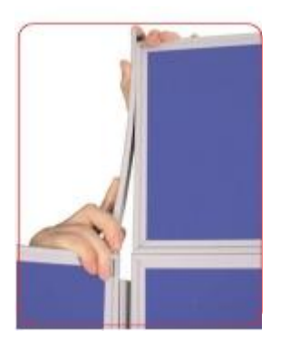
Finally clip header caps to both vertical sides of each header panel